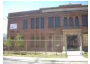
We look forward to the day when light shines through new windows.

Thank you again for your prayers, financial support, words of encouragement and for your time laboring along side us at MTC.